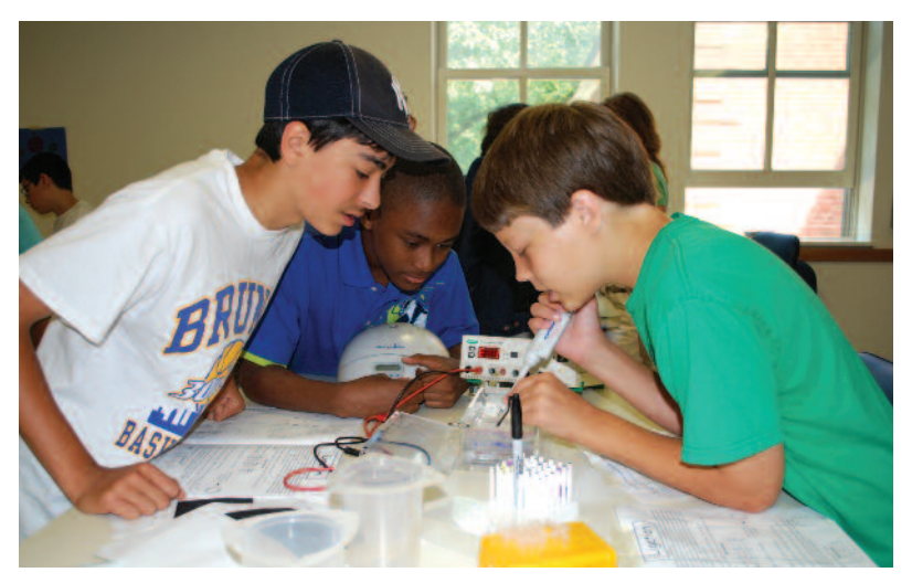
Participants in a World of Enzymes summer camp.

2,349 students from underserved schools in Queens and on Long Island.