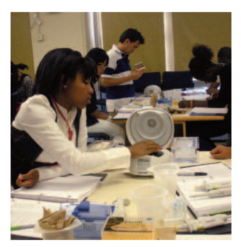
Student attending field trip at Harlem DNA Lab.

In 2010, we continued to be the world's largest provider of hands-on learning in genetics and molecular biology. Twenty thousand students performed experiments at the Dolan DNALC, DNALC West , and the Harlem DNA Lab , and 10,856 students received in-school instruction by DNALC staff. High school students composed 31% of lab visitors (9,417). Most of the 21,442 middle school visitors participated in our Genetics as a Model For Whole Learning Program. A grant from the William Townsend Porter Foundation provided scholarships for 1,057 Hispanic and African America students to attend labs at Harlem DNA Lab . Grants from Bank of America, TD Bank, and National Grid provided lab visits and in-school instruction for