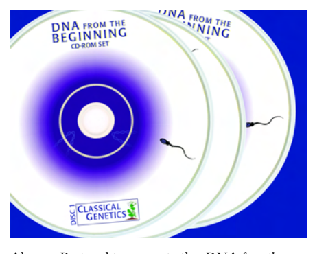
Above: Postcard to promote the DNA from the Beginning CD set. At right : The Your Genes, Your Health web site has become the most popular component of the DNALC web site.