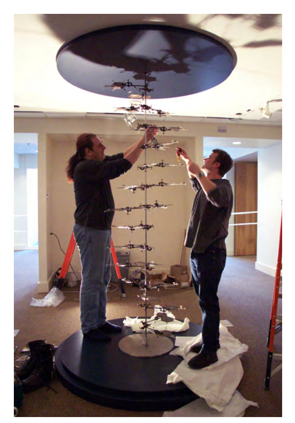
Designers from the London Science Museum install the floorto-ceiling replica of the original DNA model built by Watson and Crick.

Other installations in the central hall will return to the level of human populations and how genetic differences have evolved between them. An interactive map of the world will depict the migration paths of our earliest ancestors and illustrate some of the environmental factors that influenced human evolution. An interactive table, in the shape of